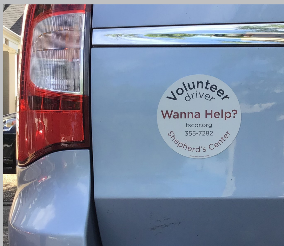
Jack Welsh's magnet encourages others to become drivers.