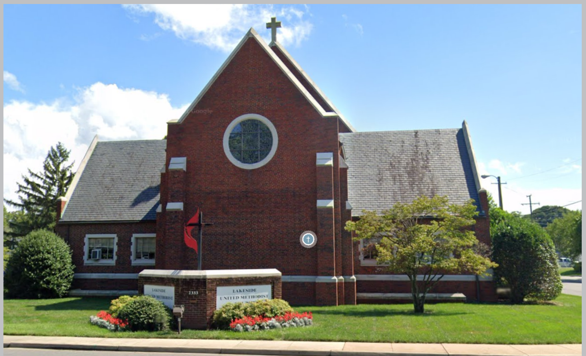
Open University's new Thursday location at Lakeside United Methodist Church, 2333 Hilliard Ave.